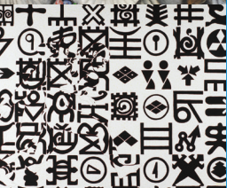
3 Zipline Southwest Greenway Movement #27 , Kwesi Owusu-Ankomah