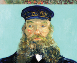
7 Detroit Riverwalk Portrait of Postman Roulin , Vincent van Gogh