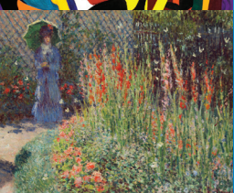
6 Detroit Riverwalk Rounded Flower Bed , Claude Monet