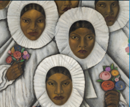
2 Plaza Behind Bagley Mobility Hub Southwest Greenway Untitled (Tehuana in Huipil Grande Headdresses) Roberto Montenegro